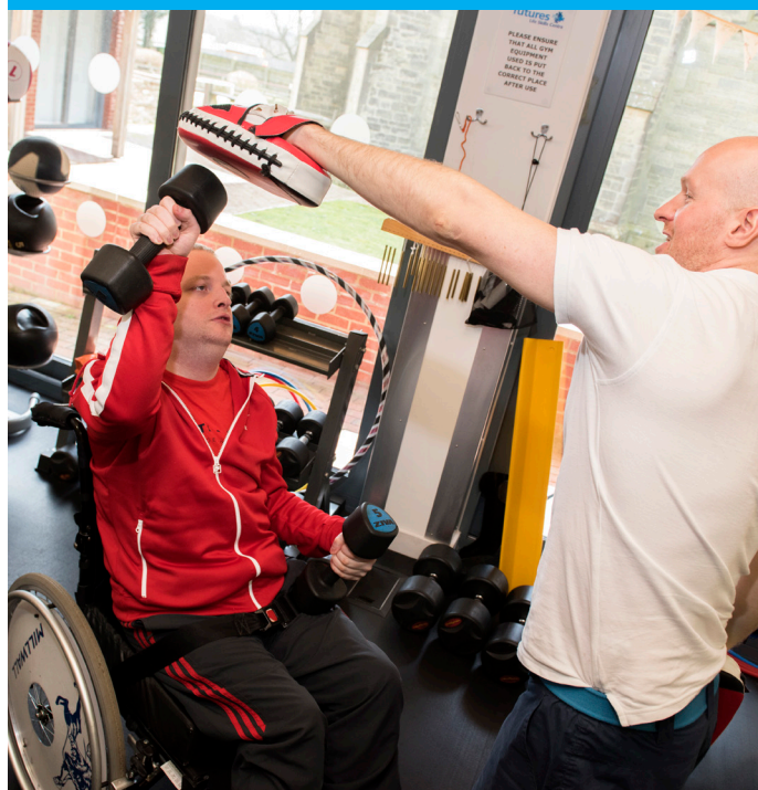
Training hard for the games

The first Chailey Games are taking place this summer! Come along on the 15th August to cheer on young people competing in disability sport.