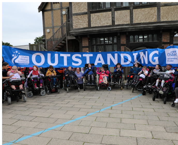
Proud to be an Outstanding school