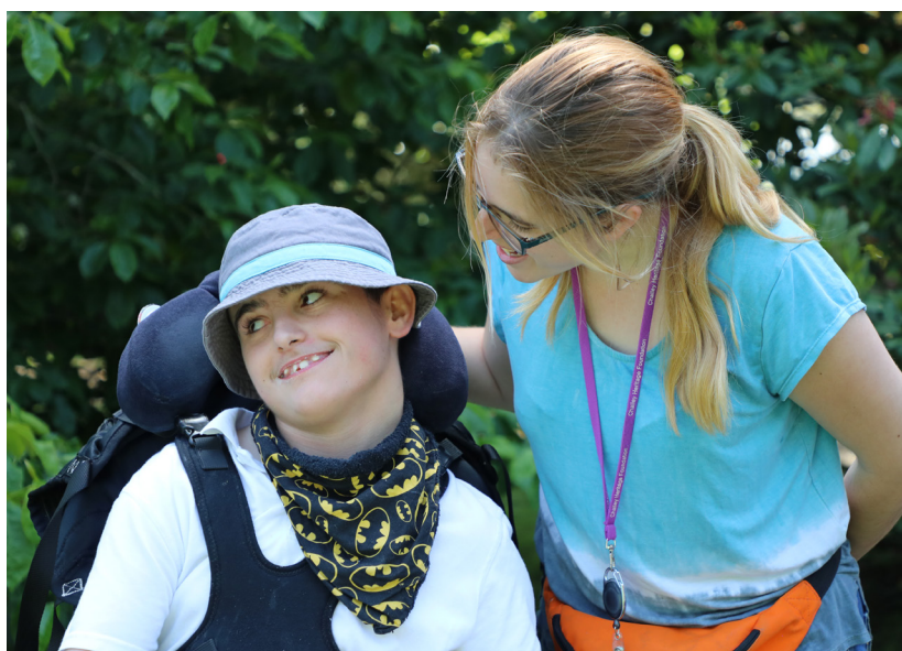
A picnic is a great excuse to get outdoors with loved ones

Prefer to get your picnic pack in the post? Not a worry! Let the fundraising team know by email to fundraising@chf.org.uk or call 01825 724 752 and we'll send you a pack in the post.