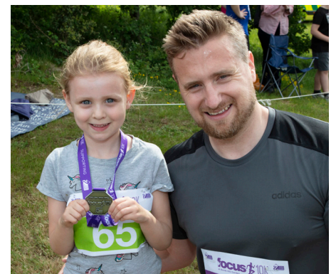
The atmosphere was great with runners smiling the whole day