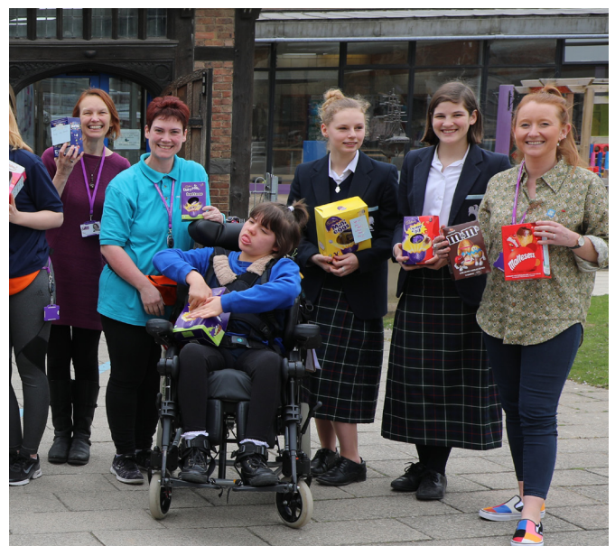
Thanks Hurst! The eggs didn't last very long...

Want to get your school involved? Email fundraising@chf.org.uk or call 01825 724 752 for a chat.