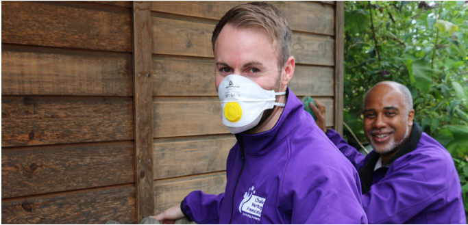
UK Power Networks varnishing the storage sheds

From volunteering to raising funds at work, or even choosing us as your charity of the year, there are many ways that we work on partnership with local businesses.