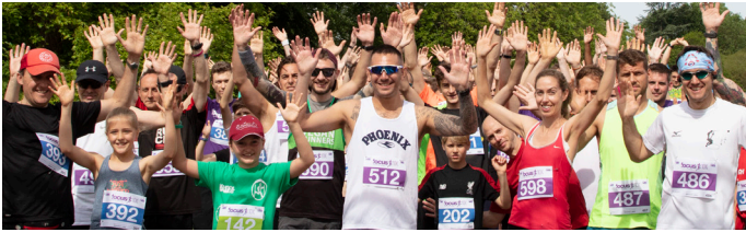
Runners excited to get going