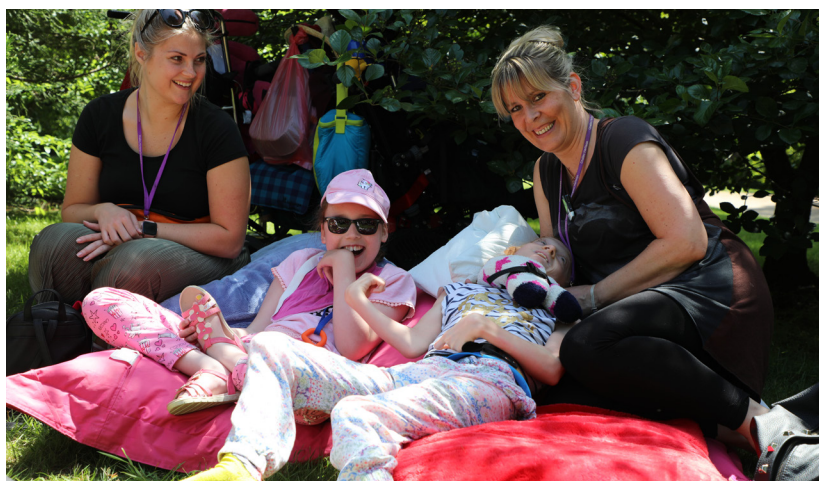
Staff and students enjoying the sunshine

Children from Chailey Heritage School got in on the action earlier this summer by holding their picnic at Sheffield Park.