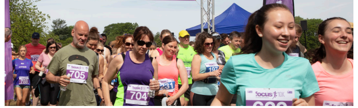
And off they go!

Returning for its 2nd year, the Focus 10k was a great success on 2nd June. Over 600 runners took on either the 10k, 5k or Mini Mile at Borde Hill Garden.