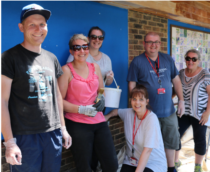
Team from Simmons Gainsford enjoying painting

Then in July, Simmons Gainsford kindly donated their time to paint some out-buildings. They also helped with some garden maintenance on Patchwork Farm.