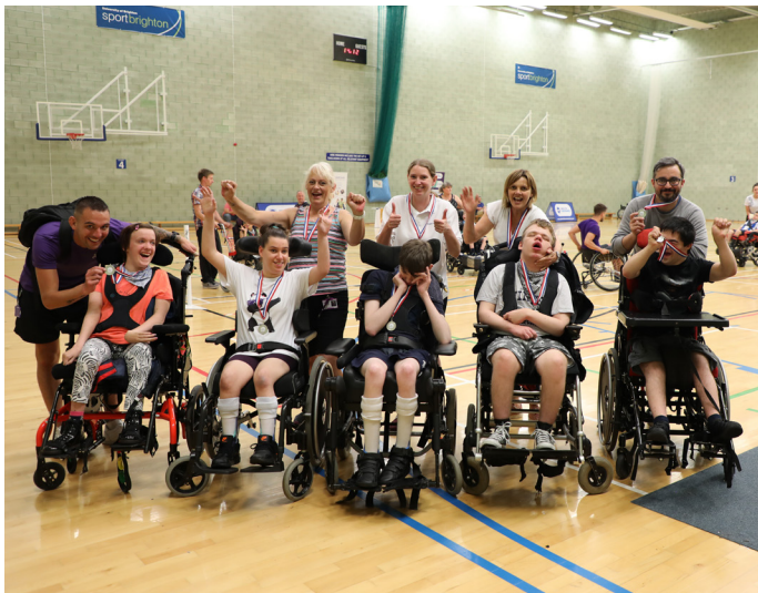
Cup winners celebrate and take in the glory!